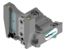
Cut-off holder (8 320 ...)