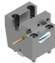
Combi facing holder (8 244 ...)