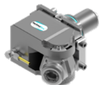
Universal head (8 043 ...)