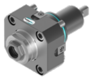
Axial drilling and milling head (8 010 ...)