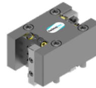
Combi double turning holder (8 251 ...)