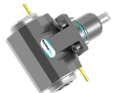
Radial drilling and milling head - DOUBLE (8 039 ...)