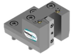
Universal turning holder with wedge style clamping (8 224 15 053)