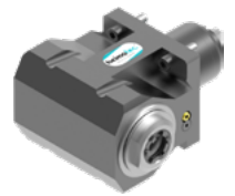
Radial drilling and milling head (8 030 ...)