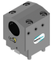
Boring bar holder (8 240 ...)